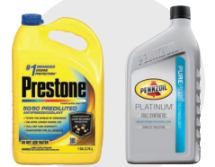
Automotive batteries, oils, fluids, and filters