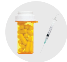
Medications, syringes, sharps