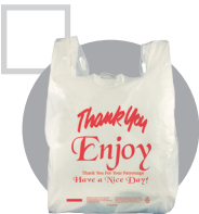
Plastic bags, wrap