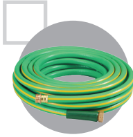
Hoses, chains, wires