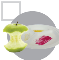
Food, food residue